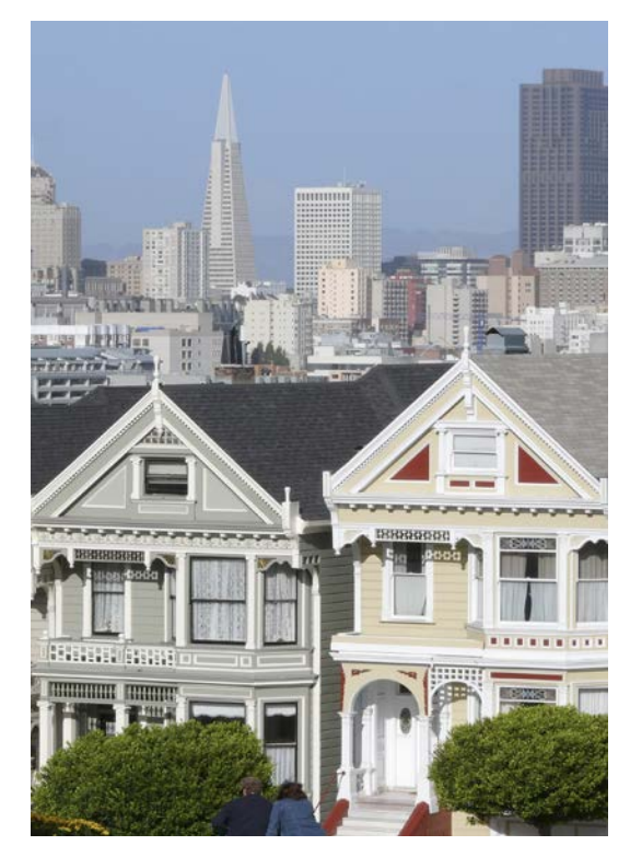
Look around the city. What shapes do you see?