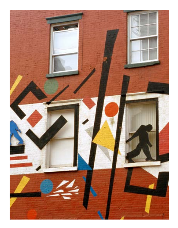
Here you see many shapes. What shapes do you see?