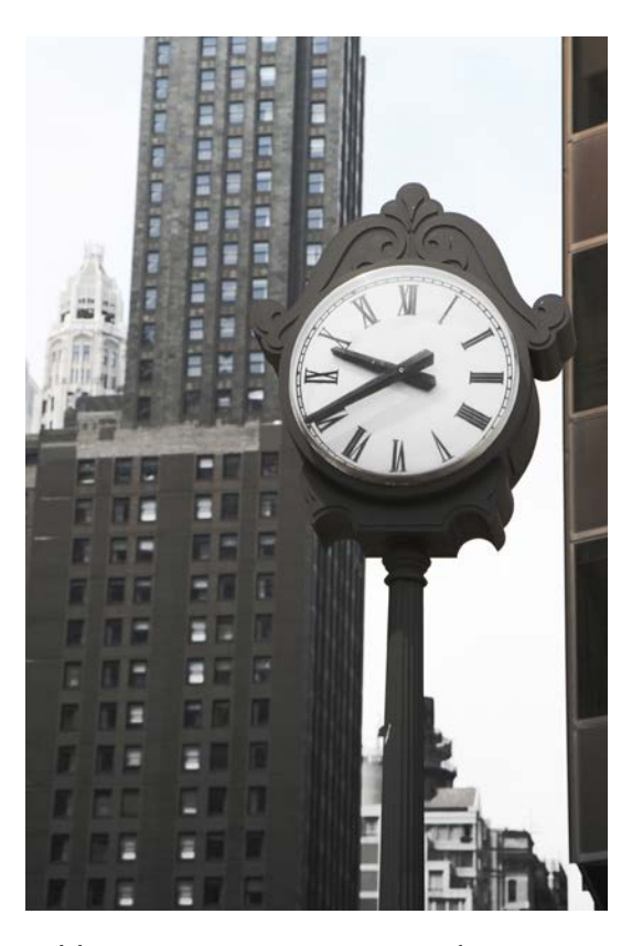
Here you see a circle.