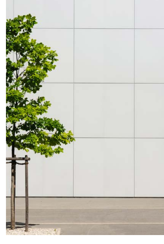
Here you see squares.